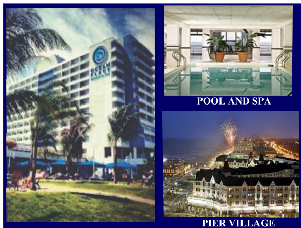
POOL AND SPA